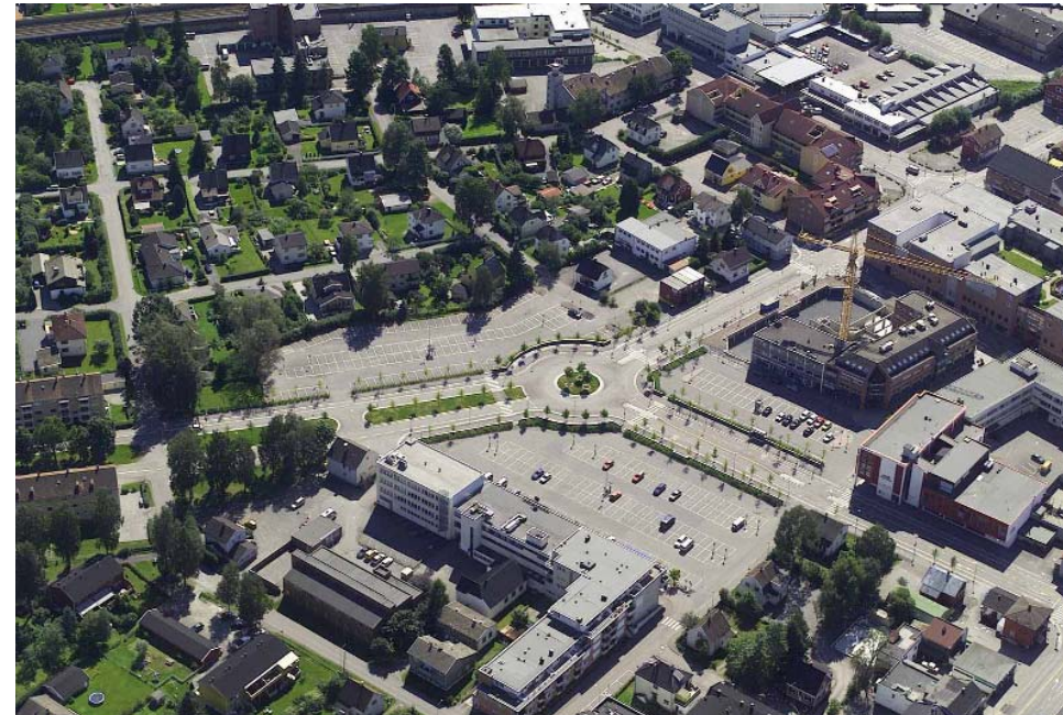
The site from north-west, view towards the detached housing