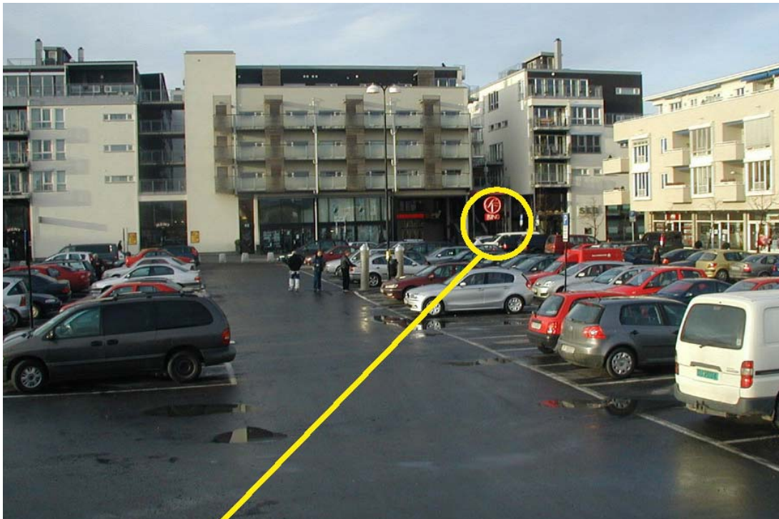
Stortorvet: parking and main entrance to the cinema