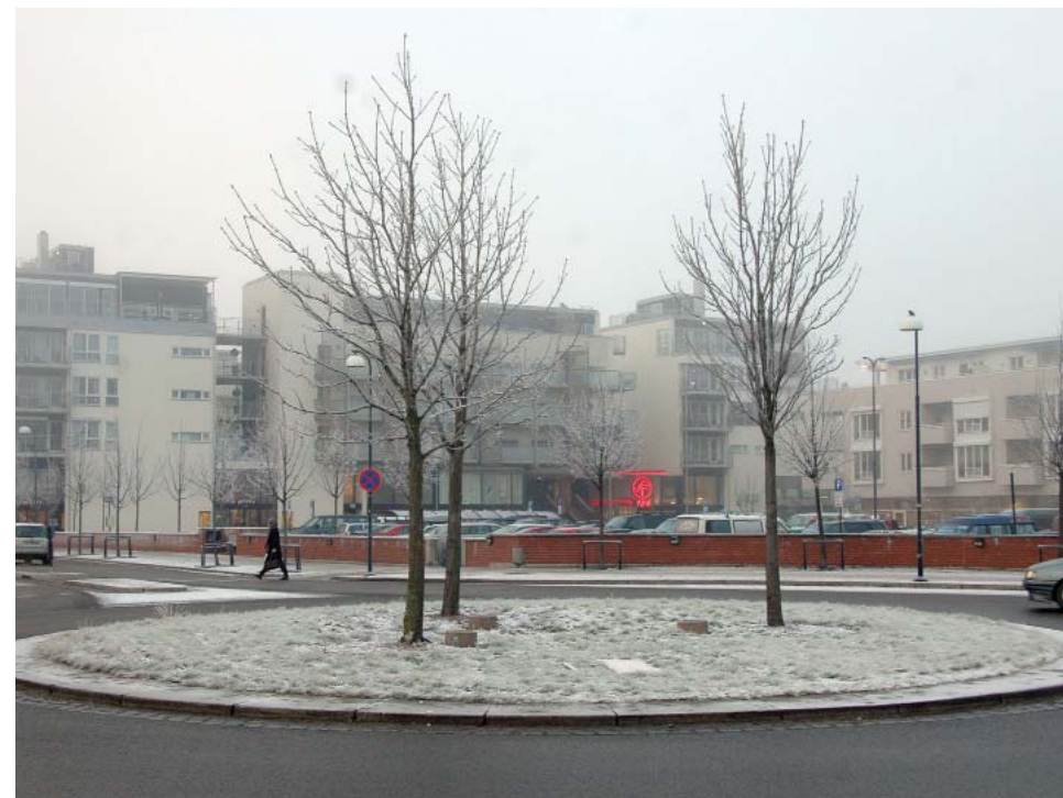
Main roundabout, cinema in the background