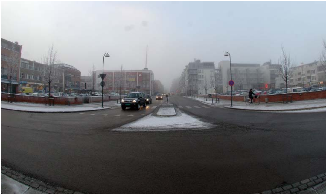
Parkalleen view towards west