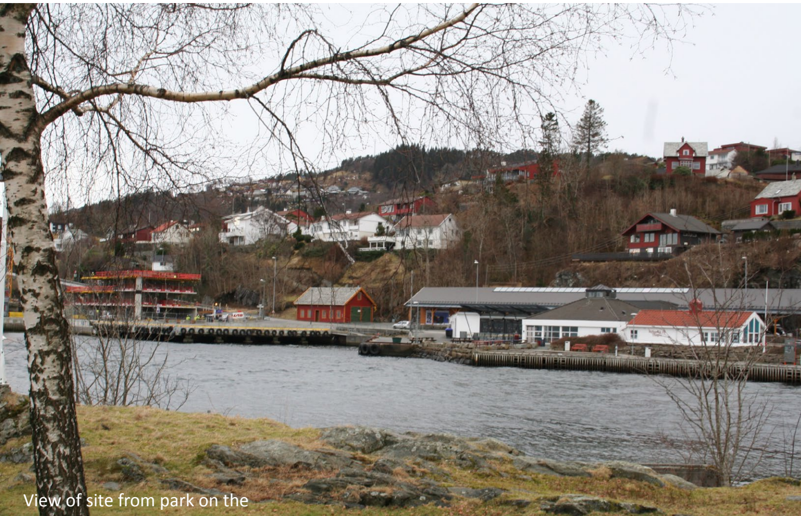
View of site from park on the