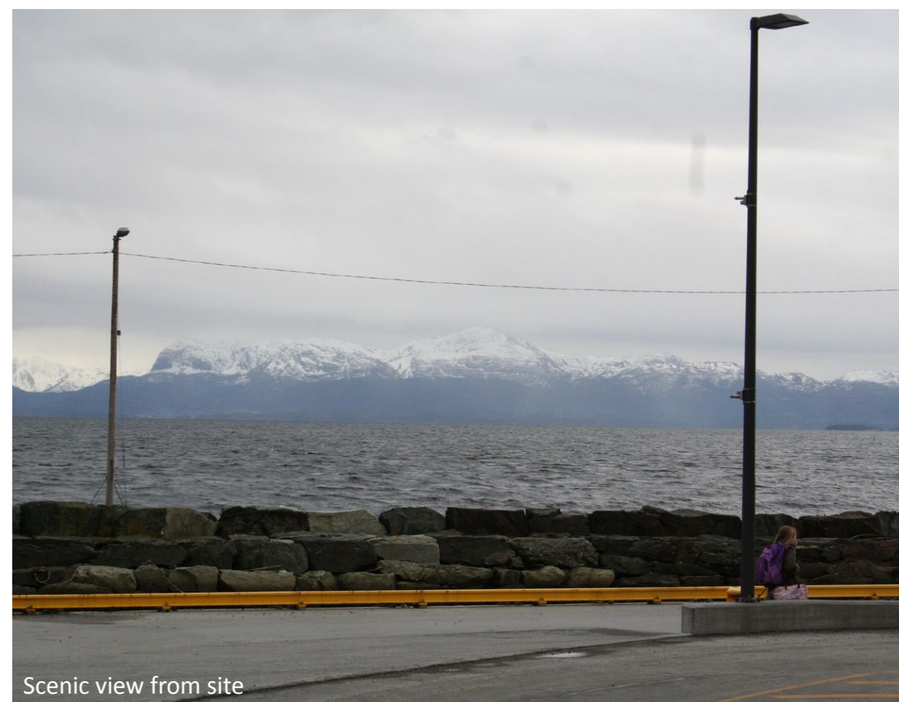
Scenic view from site