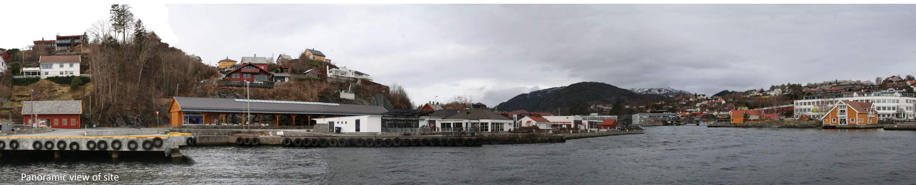
Panoramic view of site