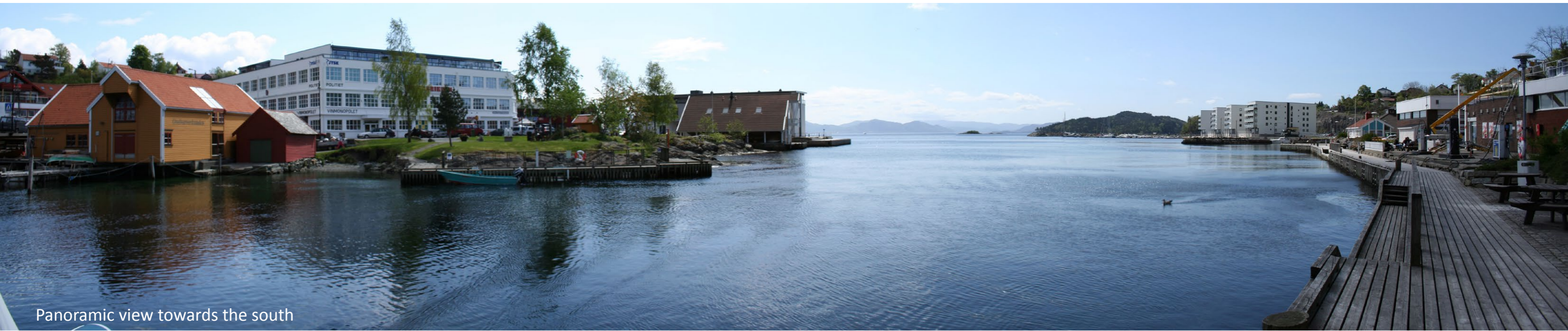
Panoramic view towards the south