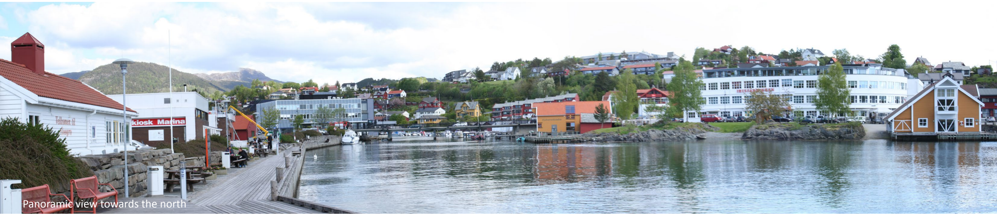
Panoramic view towards the north