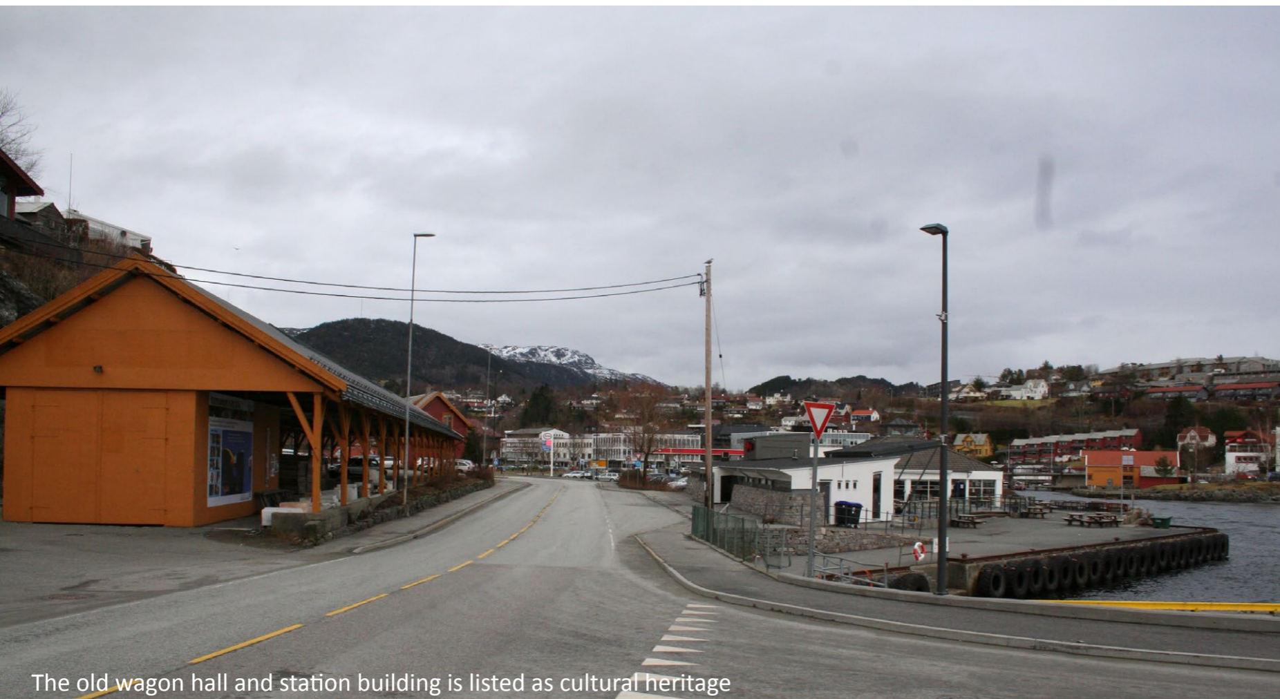
The old wagon hall and station building is listed as cultural heritage