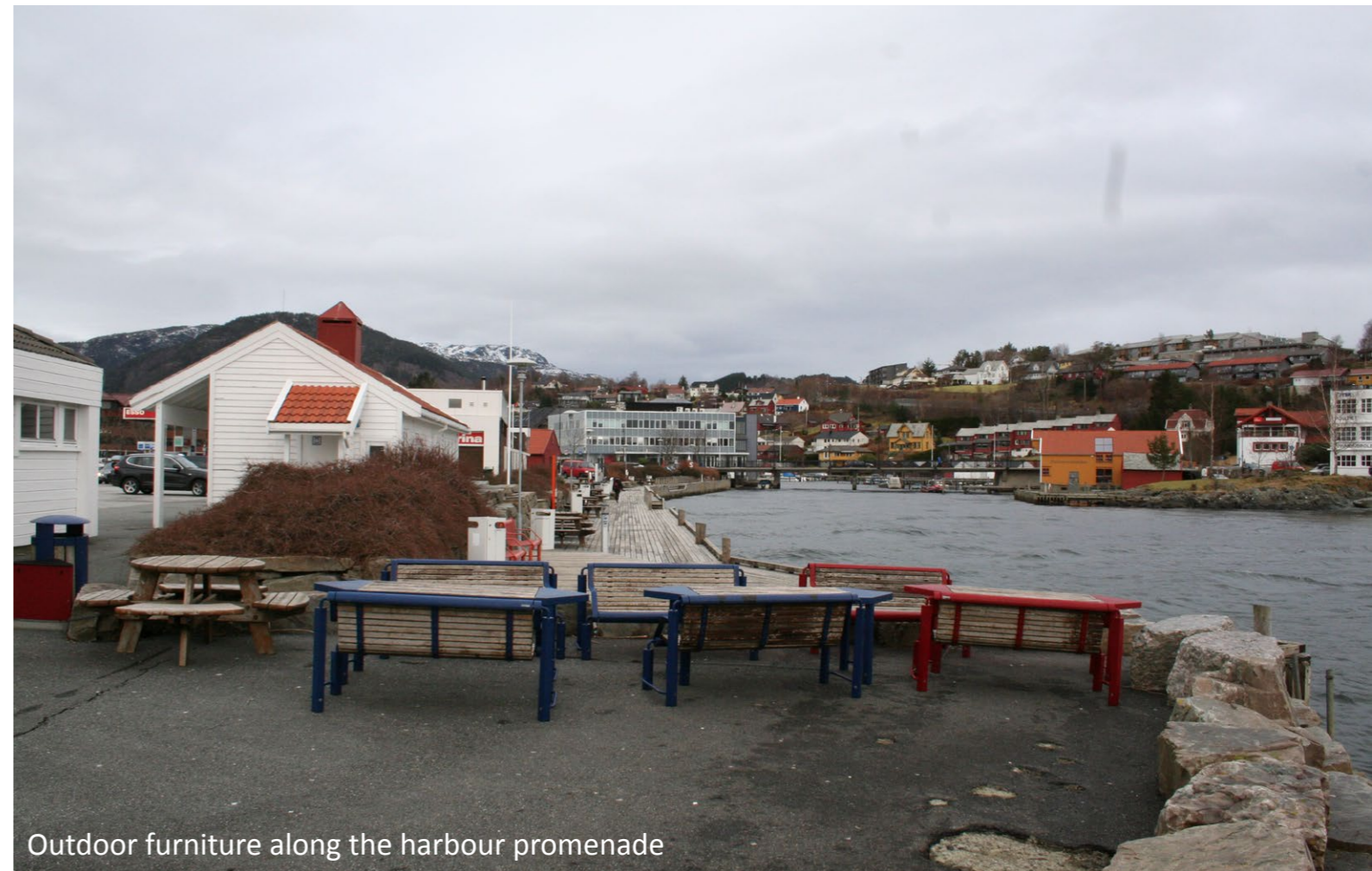
Outdoor furniture along the harbour promenade