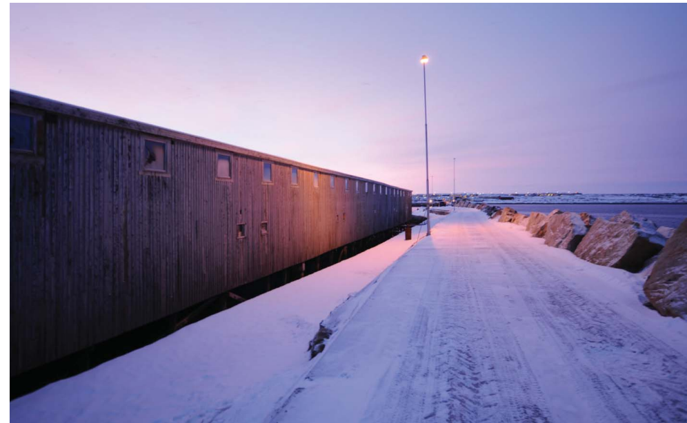
From the study area. The eastern pier.