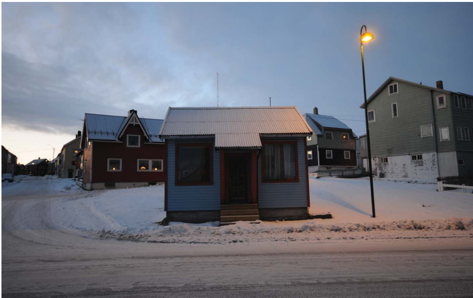
From the study area. An old kiosk.