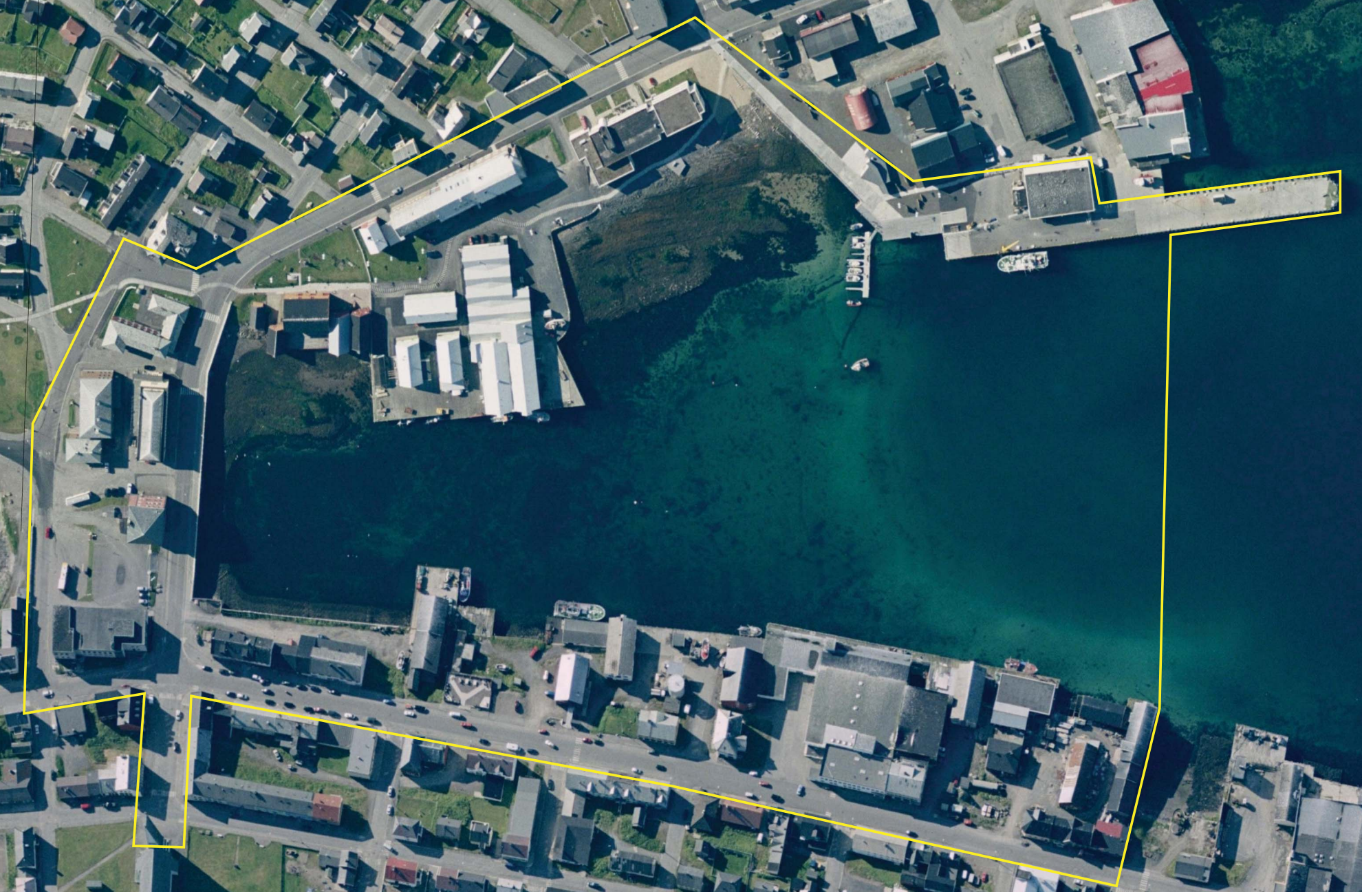
The Vardø Site. How to find new meaning in the harbour areas.