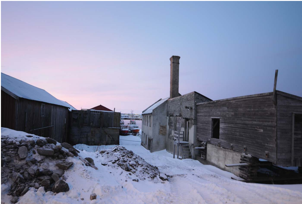
From the study area.