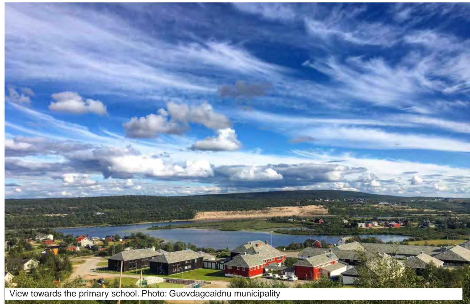
View towards the primary school.