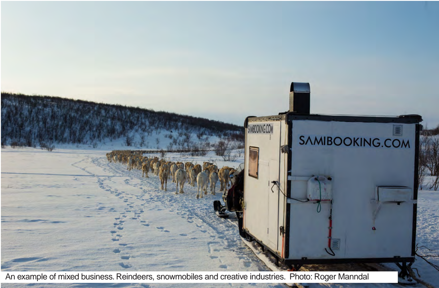
An example of mixed business. Reindeers, snowmobiles and creative industries.