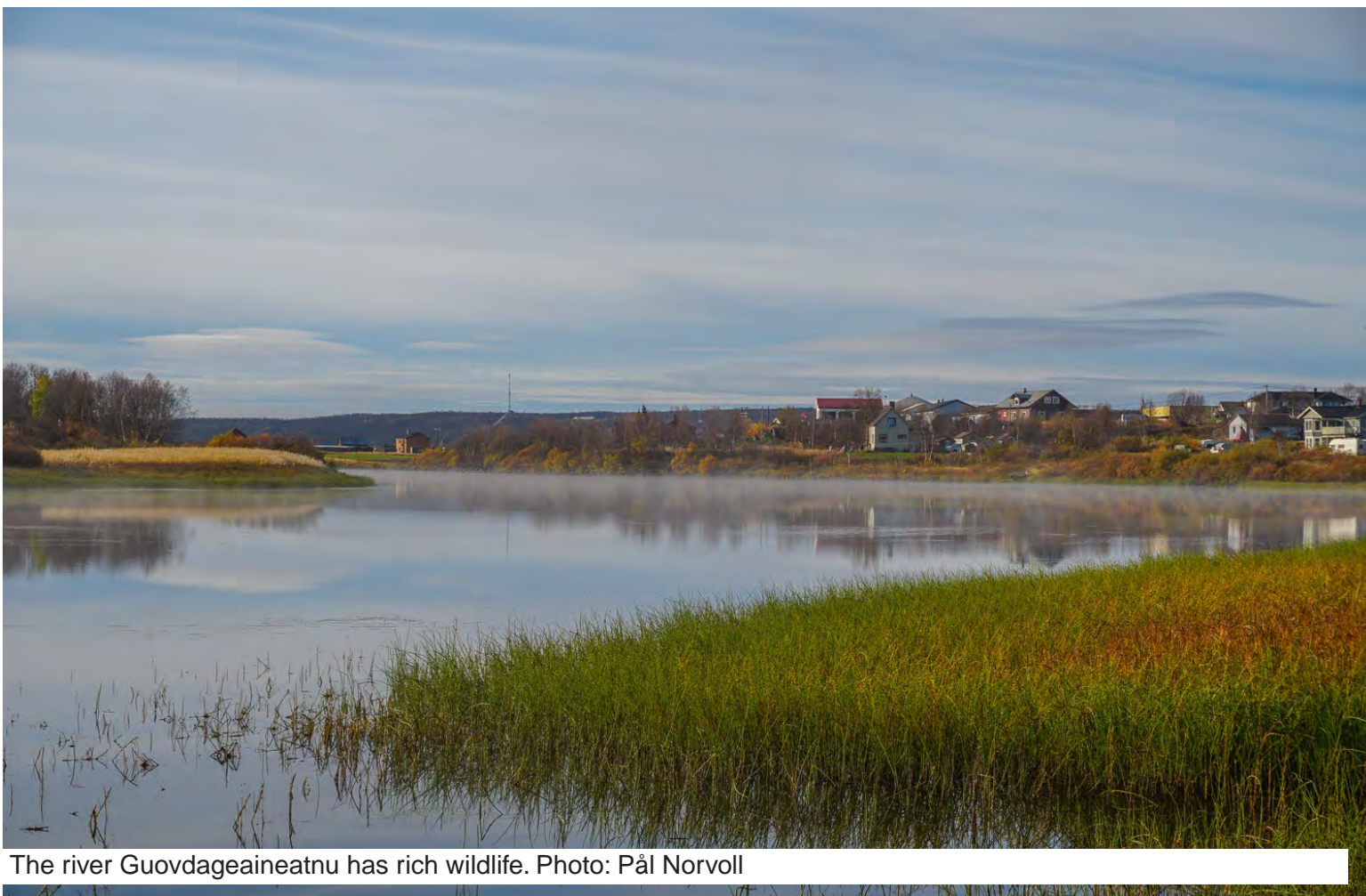
The river Guovdageaineatnu has rich wildlife.