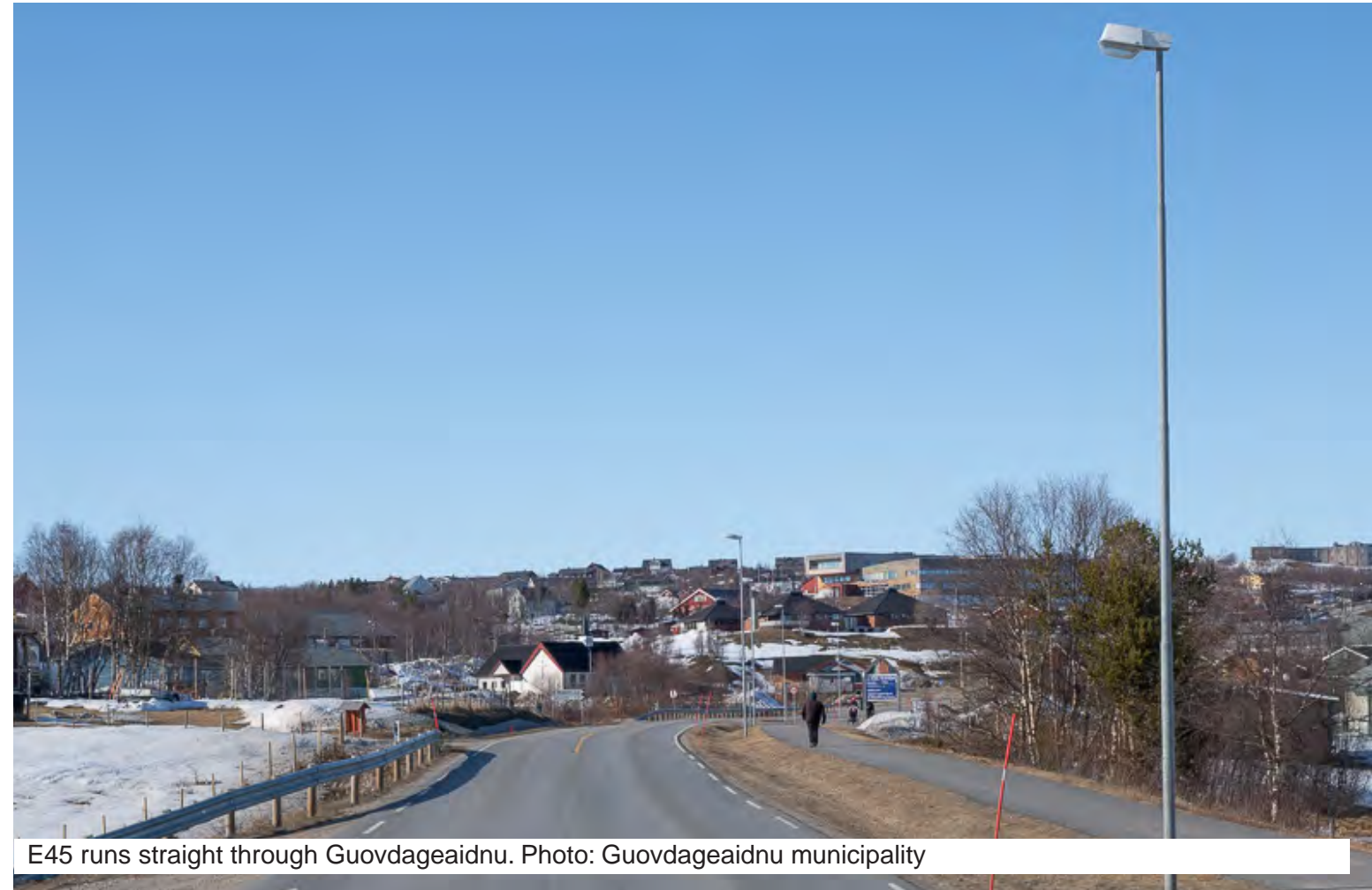
E45 runs straight through Guovdageaidnu.